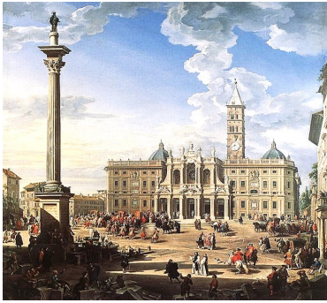
Giovanni Paolo Panini, "Basilica di Santa Maria Maggiore", 1744 Oil on canvas, 100" x 105" Palazzo del Quirinale, Rome