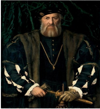
Hans Holbein the Younger (1497/1498–1543) Charles de Solier, Sieur de Morette, Ambassador of France to the King of England – 1534 - Oil on panel 29.6 in x 36.4 in Staatliche Kunstsammlungen Dresden - Gemäldegalerie Alte Meister [Public Domain]

The Catholic Gentleman: Living Authentic Manhood Today Sam Guzman, 2019, Ignatius Press, 177 pages.