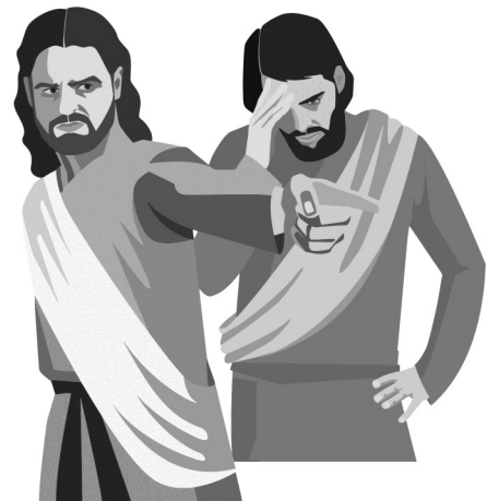
Jesus Rebukes Peter

For information about Young Adult activities Peninsula-wide, please check out the Peninsula Frassati Young Adult Facebook Page: https://www.facebook.com/groups/PeninsulaFrassatiYA/ .