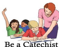
Be a Catechist